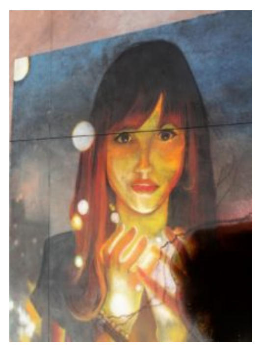
One of the pieces of of chalk art on the floor of a pavilion at Heritage Park in Nibley has a puddle from the recent rains on it.

NIBLEY – The COVID-19 pandemic has people homebound, schools released, even church was canceled.