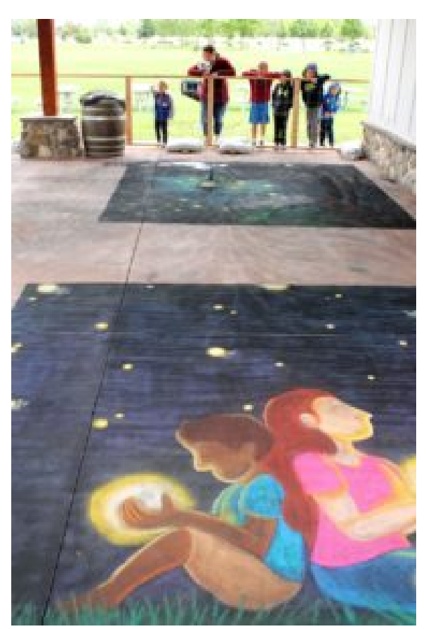
Visitors to Heritage Park in Nibley take a look at the artwork done on the floor of one of the pavilions.

Last Saturday, the city held a Disc Golf Tournament as part of their annual activities. Monday evening, a Family Bike Night Out was held with suggested routes and a photo contest.